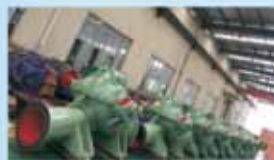
中开泵 Split case pump

TEL: (86)731-82957177 FAX: (86)731-82957100 E-mail/Skype:pump@neppump.com