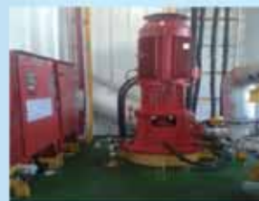
海洋平台(锦州9-3)电动消防泵 CNOOC 9-3 Offshore Platform Electric Fire Pump