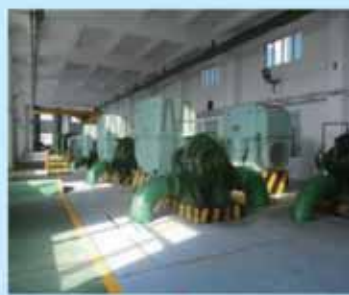
贵州北控水务中开泵 Guizhou Water Service