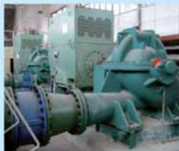
上海石化中开泵 Shanghai Petrochemical