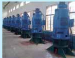
洞庭湖水利工程永丰泵站 Dongtinghu Conservancy Project