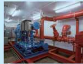
孟加拉AKG水处理站工程 AKG Water Treatment Station In Bangladesh