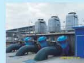
中海油和邦化学立式长轴海水泵 Vertical turbine seawater pump for CNOOC Hebang Chemistry