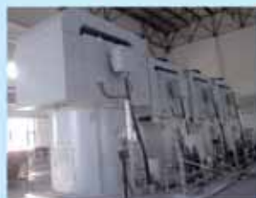
唐山LNG接收站立式长轴海水泵 Tangsha LNG Station Seawater Pump