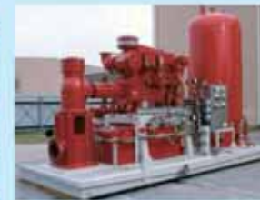
尼日尔Agadem油田一体化项目 Agadem Oil Field Integration Project in Niger