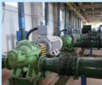
巴西CSN钢厂中开泵 CSN Steel in Brazil