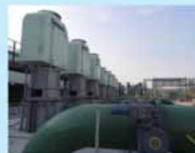
宁夏石油500万吨炼油改扩建工程 Sinopec Ningxia 5,000,000 Ton Oil Project