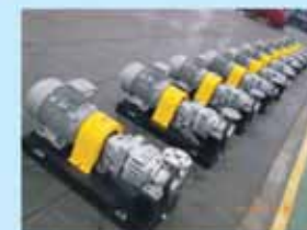
无泄漏耐腐蚀泵 Leak free corrosion resistance pump