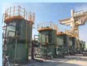
宝钢湛江立式长轴泵(吐出口径1.8米) Baosteel Project (discharge dia. 1800mm)