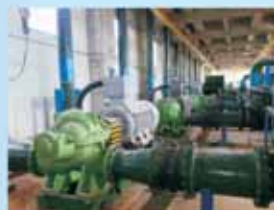
出口美国中开泵组 Splitcase pump which exported to USA