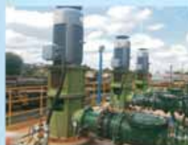
出口巴西长轴泵 Turbine pump which exported to Brazil