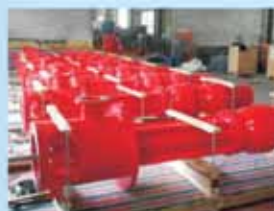
出口阿联酋消防泵 Fire pump which exported to UAE