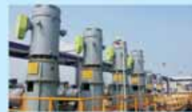
亨斯曼雨水泵 Huntsman rain water pump