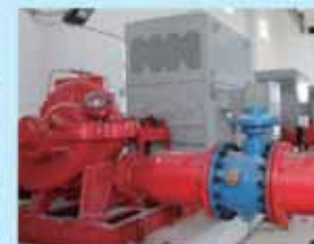
扬子石化电动消防泵 Sinopec Yangzi Petrochemical Electric Fire Pump