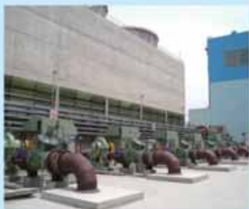
宝钢汽车板镀锌生产线中开泵 Baosteel Automobile Galvanize Line