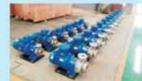
无泄漏耐腐蚀泵 Leak free corrosion resistance pump