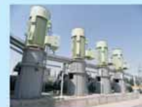
中石油宁夏炼油立式长轴泵 Vertical turbine pump for CNPC Ningxia refining project