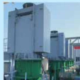
委内瑞拉项目辅机循环水泵 Venezuela project auxiliary engine circulating water pump