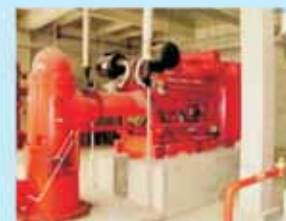
首都机场柴油机立式长轴消防泵组 Diesel Engine Vertical Turbine Fire Pump Set in Capital Airport

Application: Petrochemical, LNG Station, Offshore Platform, Power Plant, Steel, etc.