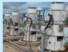
印尼苏拉威西电厂立式长轴海水泵 Power Plant In Indonesia