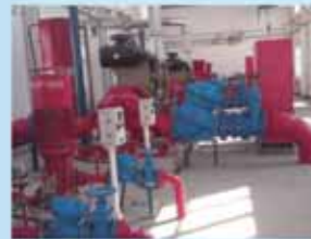
宁夏炼油柴油机消防泵 Sinopec Ningxia Refining Diesel Engine Fire Pump