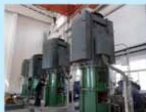
鲁阳电厂立式长轴泵(基础层以下长度23米) CNPC Luyang Power Plant (Length below foundation is 23m)