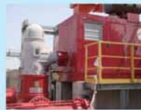
LNG柴油机海水消防泵 CNOOC LNG Station Diesel Engine Fire Pump